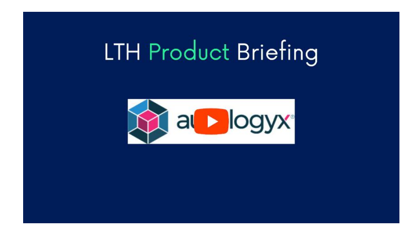
Watch the video here: <a href="https://youtu.be/cUBQIExw1Pw">https://youtu.be/cUBQIExw1Pw</a>

For legal professionals seeking to enhance efficiency, reduce operational risks, and embrace AI in a controlled manner, Autologyx offers a compelling solution that stands apart in the crowded legal tech marketplace.